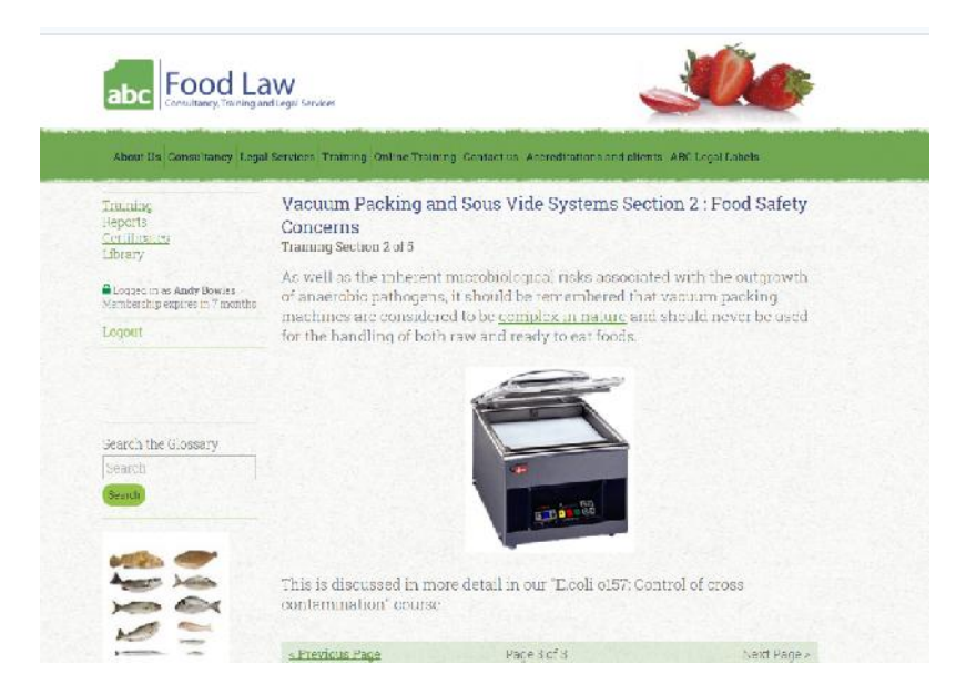
Screenshot from training pages

Objectives: To provide the user with an understanding of the key food safety hazards and appropriate controls for these techniques.