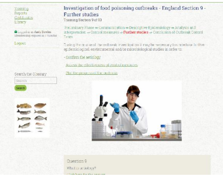
Screenshot from training pages